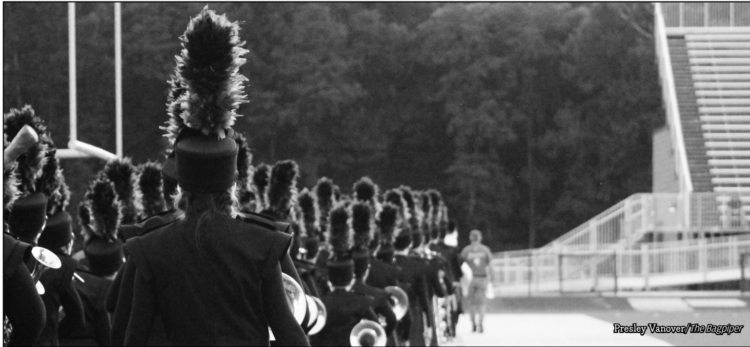
THE FC HIGHLANDER BAND marches onto the football field before their performance at the parent show on Aug. 8.